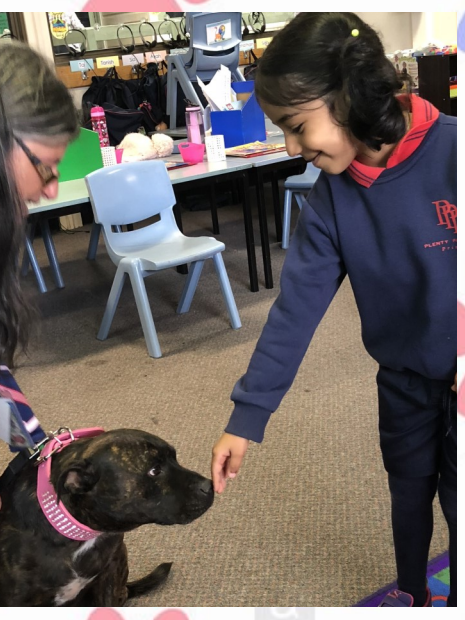
We let them smell us.