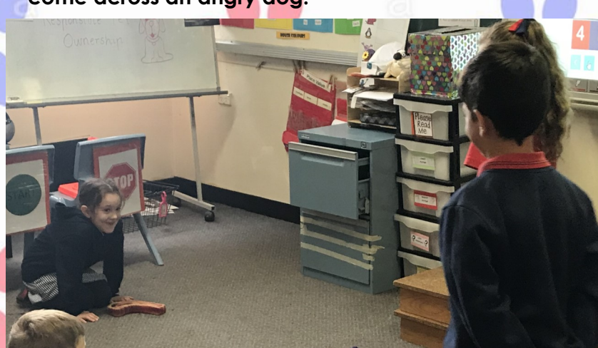
We don't approach a dog when it is eating.