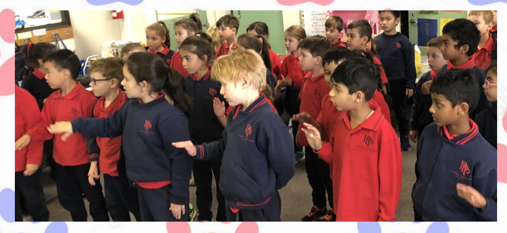
We learnt to walk up slowly and stop, ask the owner, let the dog smell your hand and stroke gently by singing a song.