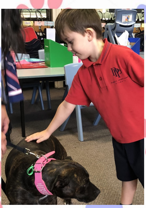
Then we pat them gently.