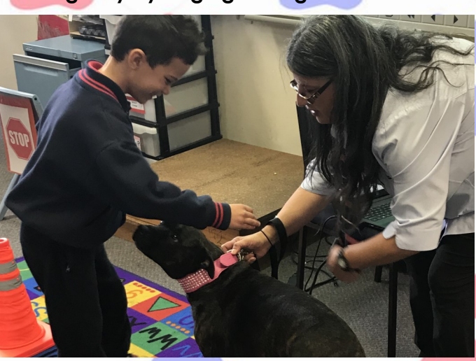
"Can I please pat your dog?"